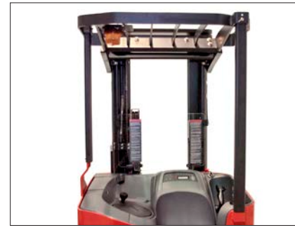
Universal Stack-Stance Configuration